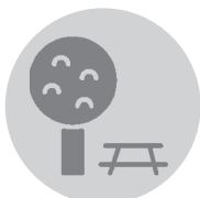
Parks and Gardens