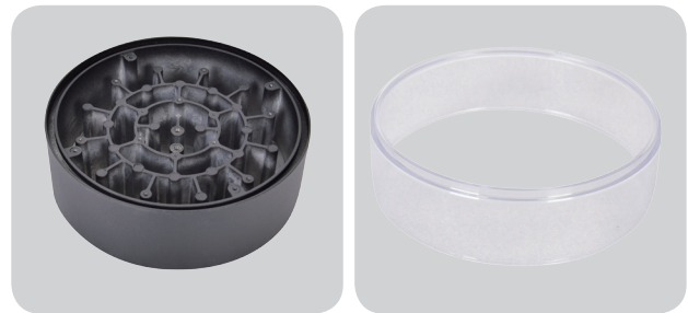
Die casting heatsink