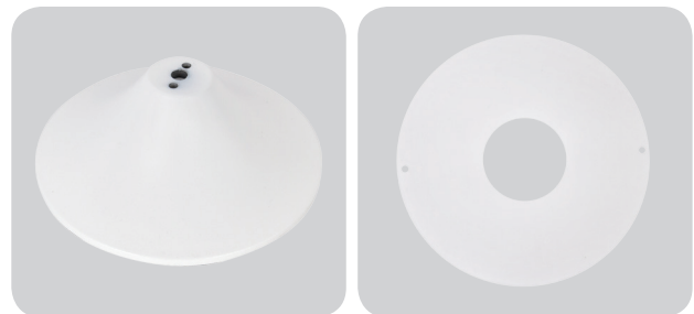
Die casting reflector